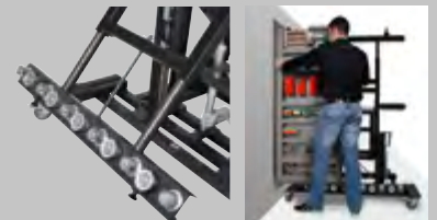
ROLLER CONVEYOR for sideways insertion of the mounting panel into the control cabinet Prod.-No. 031001-004