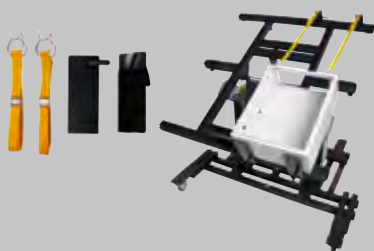
CONTROL CABINET SET Prod.-No. 03100-005